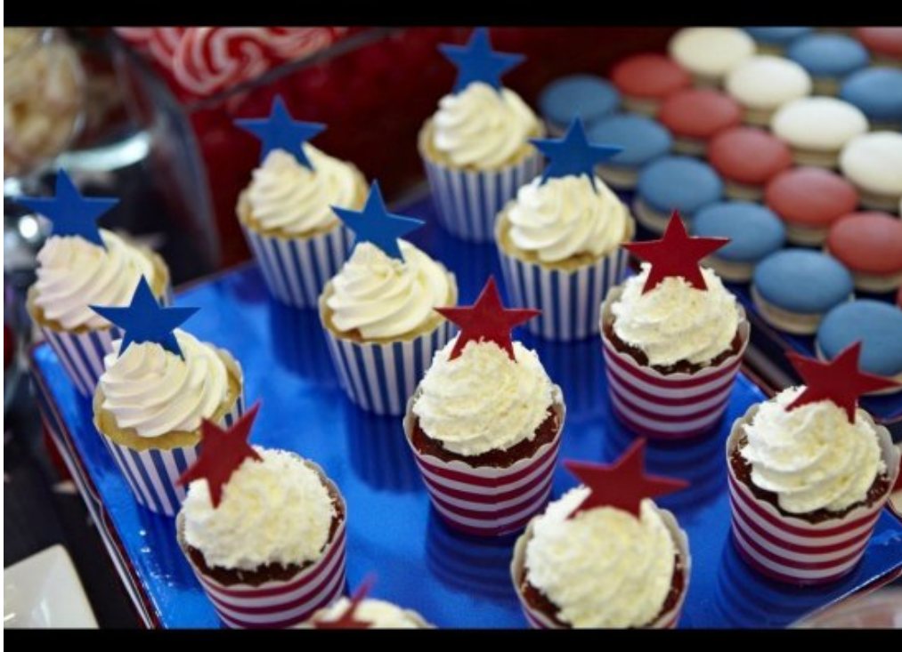
Cupcakes by Petite Sweet featured here include two flavors. Strawberry Champagne: vanilla cupcakes infused with strawberry jam, topped with champagne French buttercream. And Coconut Red Velvet: traditional red velvet cupcakes with coconut French buttercream.