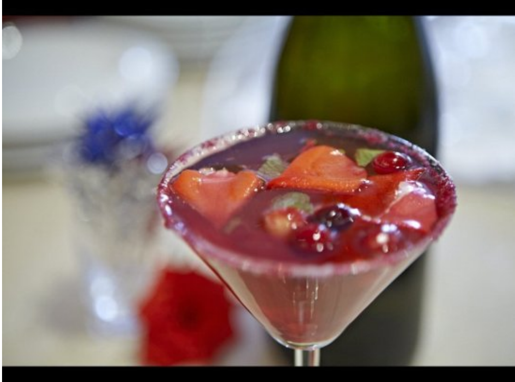
Vodka, galliano, raspberry juice and champagne.