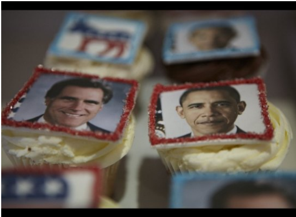
Festive Election Night Cupcakes by Eat My Words. Their delightfully decorative, and divinely delicious edibles help to raise money and awareness for the Stephen Lewis Foundation.