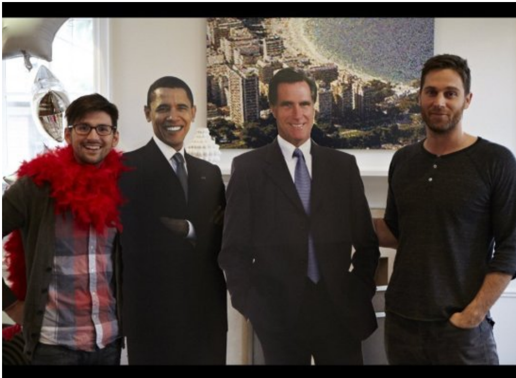
Photographer and chef pose with President Obama and Mitt Romney.