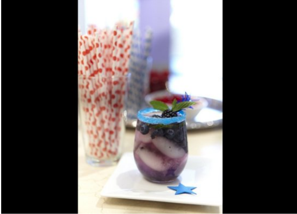
Blueberry and Hendricks gin and cucumber smash.