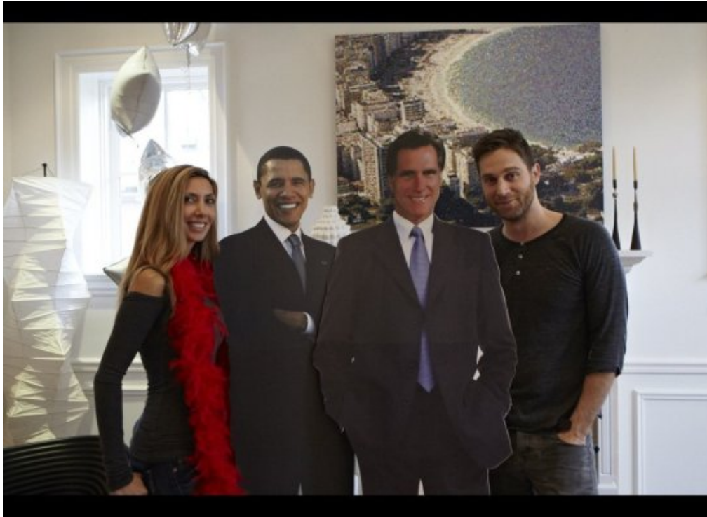
Hostess and chef pose with President Obama and Mitt Romney.