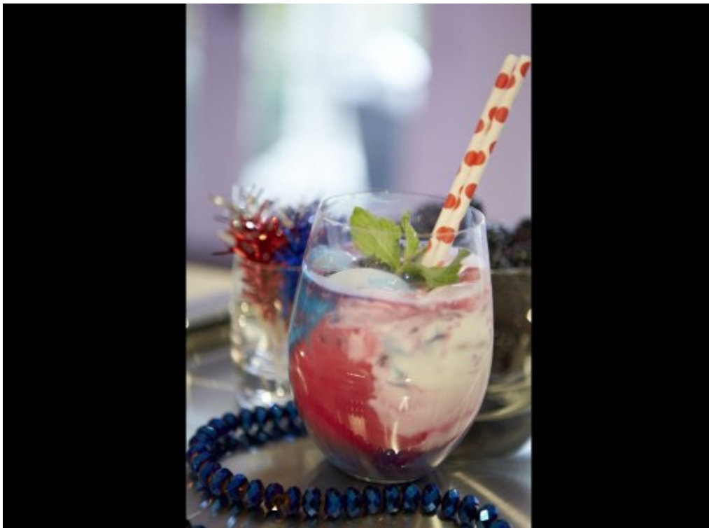
Blackberry, strawberry, coconut rum ice cream milkshake.