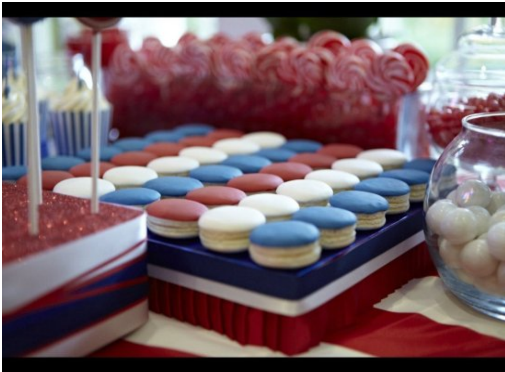
Macarons by Petite Sweet made with delicate almond meringue cookies with crunchy shells and soft interior. Flavors included, White Salted Caramel, White Chocolate Lime and Strawberry Coquelicot.