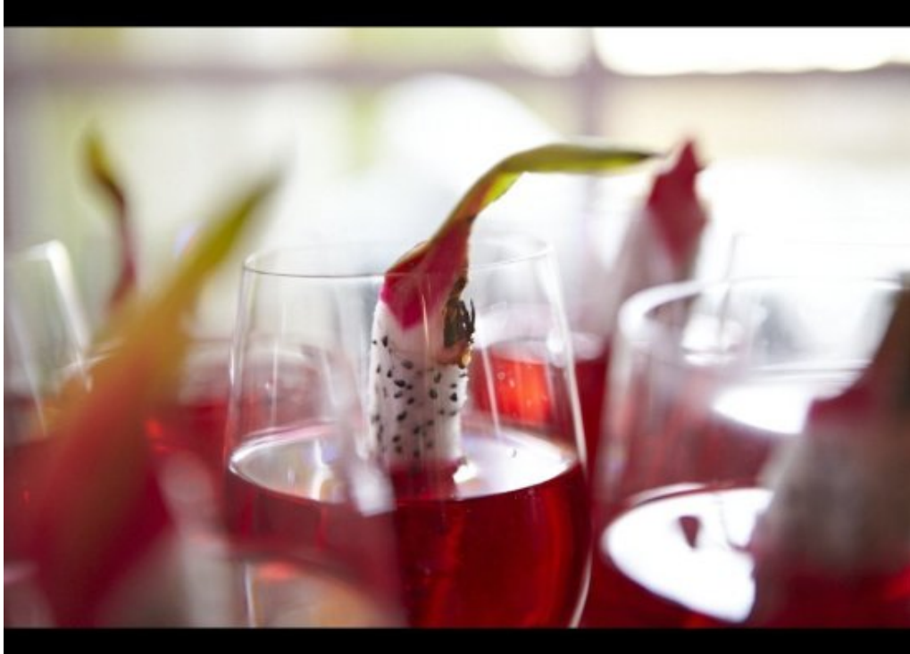
Dragon fruit and tequila cocktail.