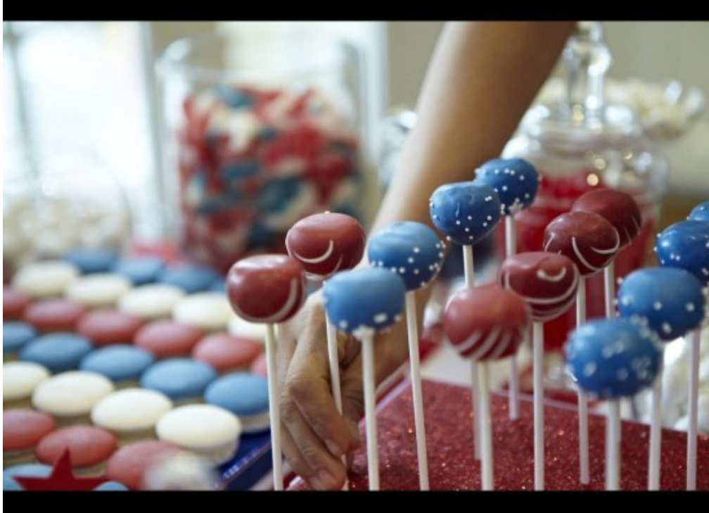
Cake Pops by Petite Sweet. Freshly made chocolate cake and Swiss meringue buttercream come together on a stick to make these delicious, hand-decorated cake pops. Dipped, sprinkled and drizzled in red, white and blue, they're a sweet bite of celebration.