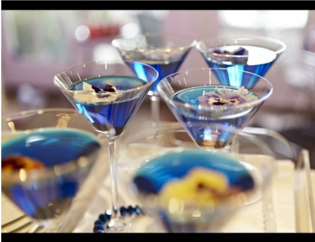
Blackberry infused vodka martini garnished with edible nasturtium flowers.