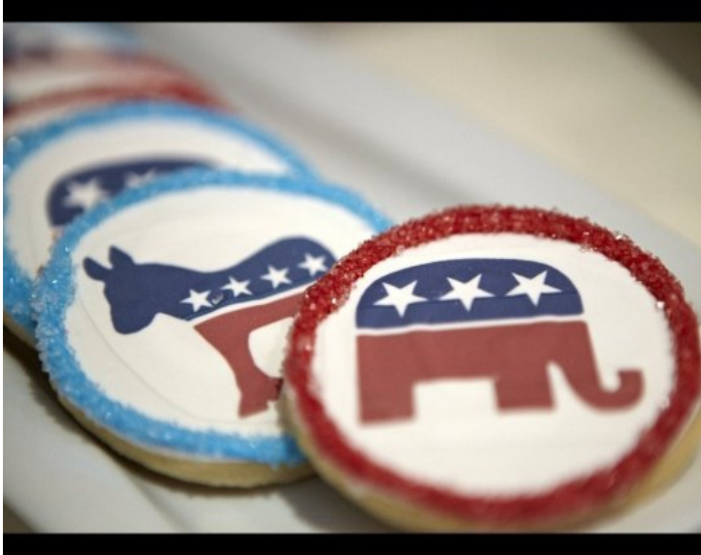
Festive Election Night Cookies by Eat My Words. Their delightfully decorative, and divinely delicious edibles help to raise money and awareness for the Stephen Lewis Foundation.