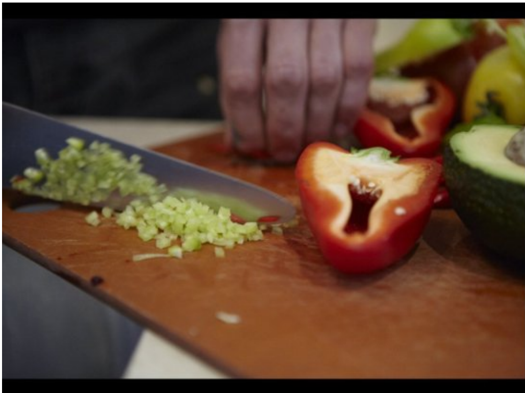
Preparing California white sea bass tostada.